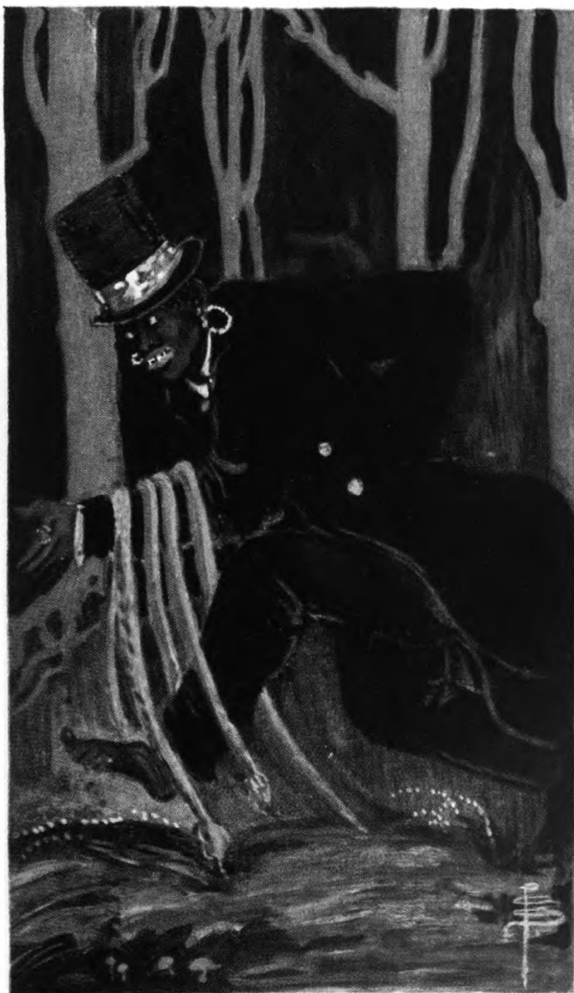
"Oolanga's black face . . . peering out from a clump of evergreens."